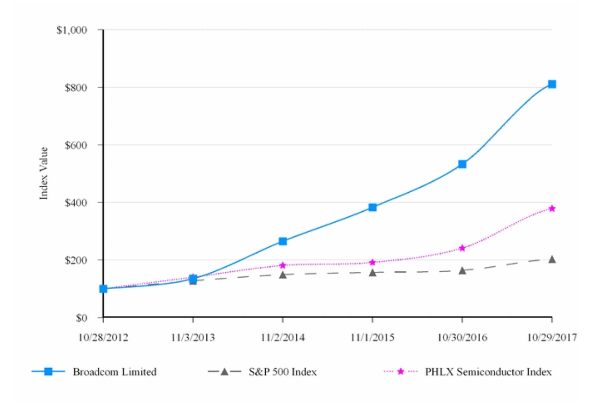
Comparison of Five Year Cumulative Total Return Among Broadcom Limited, the S&P 500 Index and the PHLX Semiconductor Index