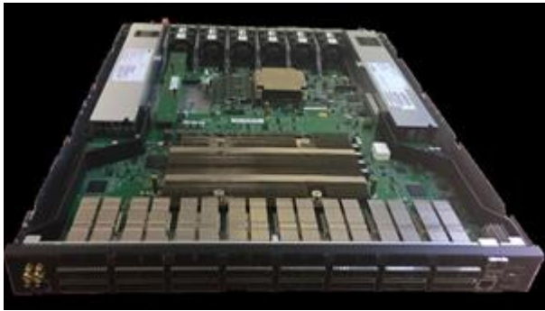
Edgecore Networks AS9716-32D. Description: 1RU, 32 x 400GbE QSFP56-DD platform, OCP contributed design. Switching Chipset: Broadcom Tomahawk 3 12.8Tbps (BCM56980). Control Plane Complex: Broadwell-DE CPU. Availability: Now