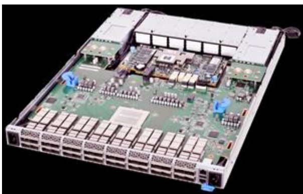
Quanta Cloud Technology T9032-IX9. Description: 1RU, 32 x 400GbE QSFP56-DD platform. Switching Chipset: Broadcom Tomahawk 3 12.8Tbps (BCM56980). Control Plane Complex: Broadwell-DE CPU, 32GB DRAM, 128GB M.2 Flash. Availability: Now.

SAN JOSE, Calif., Oct. 24, 2018 (GLOBE NEWSWIRE) -- Broadcom, Inc. (NASDAQ: AVGO), today announced that it has fully qualified the StrataXGS® Tomahawk® 3 switch series for production release, enabling high-volume deployment of Ethernet network equipment based on market-leading 12.8 Terabits/sec of switching and routing performance implemented on a single chip. The Tomahawk 3 series is the industry's first fully production-qualified silicon family that supports high-density, line-rate 400GbE, 200GbE, 100GbE, and 50GbE interconnect for massive scale-out of software-defined cloud data centers, reducing cost per port by 75% and power-per-port by 40% compared to existing solutions.