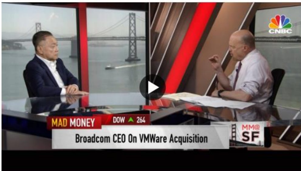
Jim Cramer interviews Broadcom's Hock Tan on CNBC's Mad Money