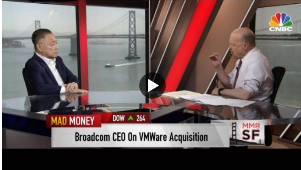
Jim Cramer Interviews Hock Tan on CNBC's Mad Money