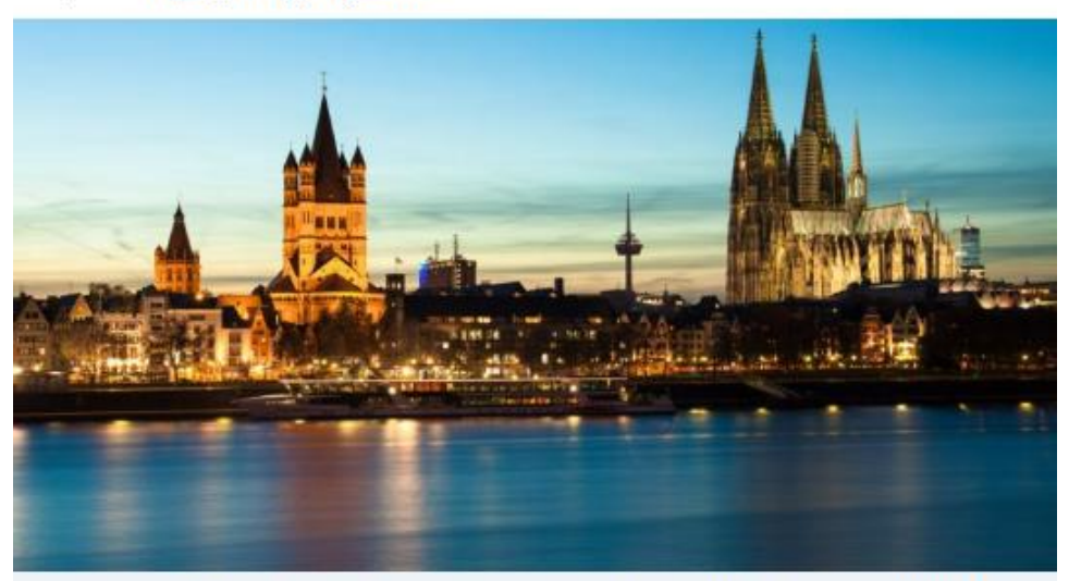
Broadcom and Deutsche Telekom: Discussing a Multi-Cloud Future at DIGITAL X 2022

symantec-enterprise-blogs.security.com • 6 min read